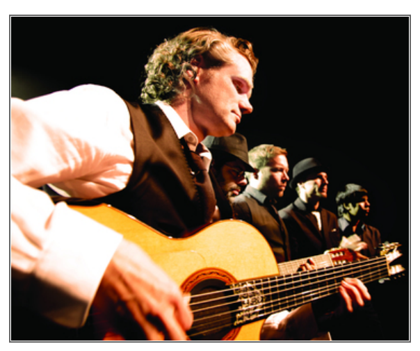
In tune. Toronto-based guitarist Jesse Cook will bring his jazzy latin- and world-influenced music to the Rose Theatre May 2 for a special performance.

"We were looking all over southern Ontario for a theatre which met our requirements. Because of the cameras, we needed a certain size, not too big or it would look cavernous, not too small and with the amenities of a world class hall,